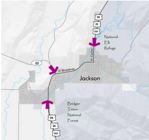
Town of Jackson's three major gateways.